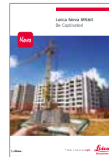
Leica Nova MS60