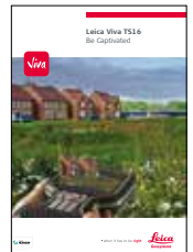
Leica Viva TS16