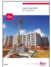
Leica Viva GS15