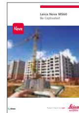
Leica Nova MS60