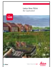
Leica Viva TS16