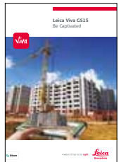
Leica Viva GS15